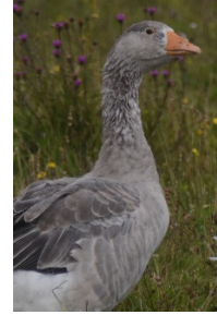
Best goose (Gwenda) at the Sanday Show

I enjoy attending such community functions, as it gives me the opportunity to meet and chat with ward constituents in an informal setting. I welcome invitations to island events and will always try to come along if I can.