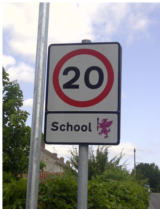
Permanent 20 mph speed limit outside an English village school

During the councillors' recess I travelled extensively through our United Kingdom and across to the continent seeing how people do things elsewhere. For example: in Lancashire rural communities have clubbed together in the "B4RN" project to bring high-speed broadband to the areas BT won't go to; in Wales and in England I saw village schools and community centres protected by permanent 20 mph speed limits; and I learnt that some small island nations impose a "tourist tax" to help compensate for the negative impact of cruise-liner visits. All ideas I am sure we could apply to the Orkney scenario. Furthermore, ferries - I crossed the English Channel for less than it costs to cross the Pentland Firth, and I discovered how low ferry fares are on the west coast of Scotland compared to ours, thanks to the Road Equivalent Tariff.