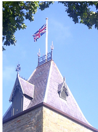
OIC celebrates Her Majesty's record-breaking reign of 23,226 days, 16 hours, 24 minutes*

In my new role as Vice-Chair of Education, Leisure & Housing (ELH), I was one of the delegates at the Islands Education Summit hosted by OIC, and reported in The Orcadian . (Did you spot the Sanday tie being worn by the Leader of Shetland Islands Council?) It was attended by the Cabinet Secretary for Education & Lifelong Learning, Angela Constance MSP, and, as well as my input into the workshops, I managed to spend time in conversation with her about the special situation of teachers in small island schools, GTC registration issues affecting applicants for teaching posts in our schools, and the particular challenges faced by life-long learners in the Isles, especially those who missed out on formal school qualifications. I believe I managed to drive the message home to members of the Scottish Government and Education Scotland that "insularity" needs to be a recognised special characteristic quite distinct from "rurality", and its peculiar problems and costs acknowledged.